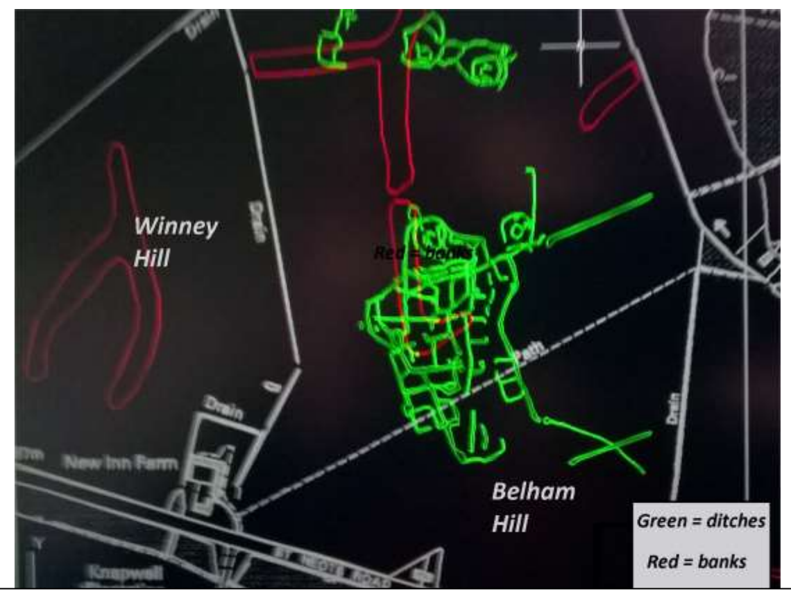
Figure 1. Combined aerial photo/Lidar interpretation of landscape features in Belham Hill.

Childerley which is too far away but the Historic England aerial and lidar interpretation does indicate a likely settlement nearby in Belham Hill. Its date is unclear – it may be from the Iron Age to the medieval period. This will be investigated as part of our on-going survey of the south-west corner of the estate.